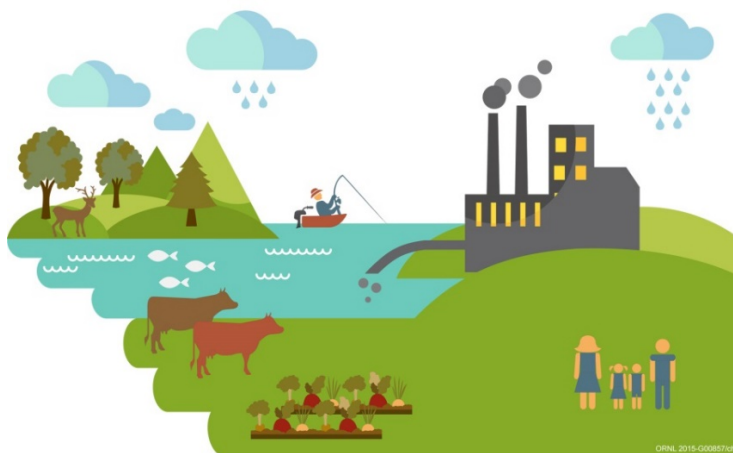
Figure E.2. Examples of radiation pathways

People can be exposed to radionuclides in the environment through a number of routes, as shown in Figure E.2. Potential routes for internal and external exposure are referred to as pathways. For example, radionuclides in air could be inhaled directly or could fall on grass in a pasture. If the grass were then consumed by cows, it would be possible for the radionuclides to impact the cow's milk, and people drinking the milk would be exposed to this radiation. Similarly, radionuclides in water could be ingested by fish, and fishermen or other consumers could then ingest the radionuclides in the fish tissue. People swimming in the water also would be exposed. Exposure to ionizing radiation varies significantly with geographic location, diet, drinking water source, and building construction.